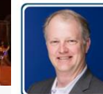
WHO OWNS A STUDY?

While advancing site sustainability is the underlying mission of SCRS, Sites NOW delivers a platform to meet, share, and explore solutions that advance thoughts, best practices, and – most importantly – relationships.