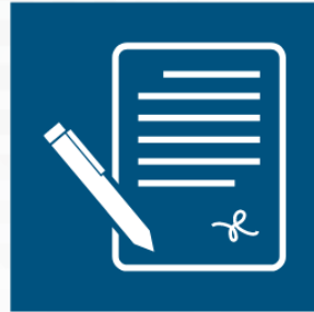
Budgets & CTAs